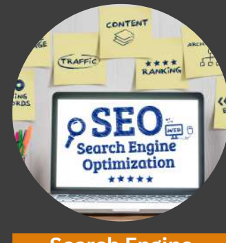
Search Engine Optimization