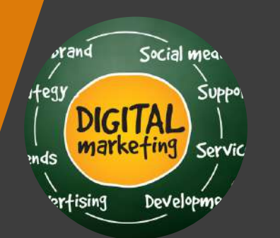
Digital Marketing Overview