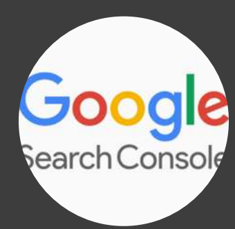
Google Search Console